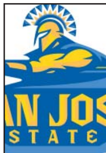
SAN JOSE STATE SPARTANS