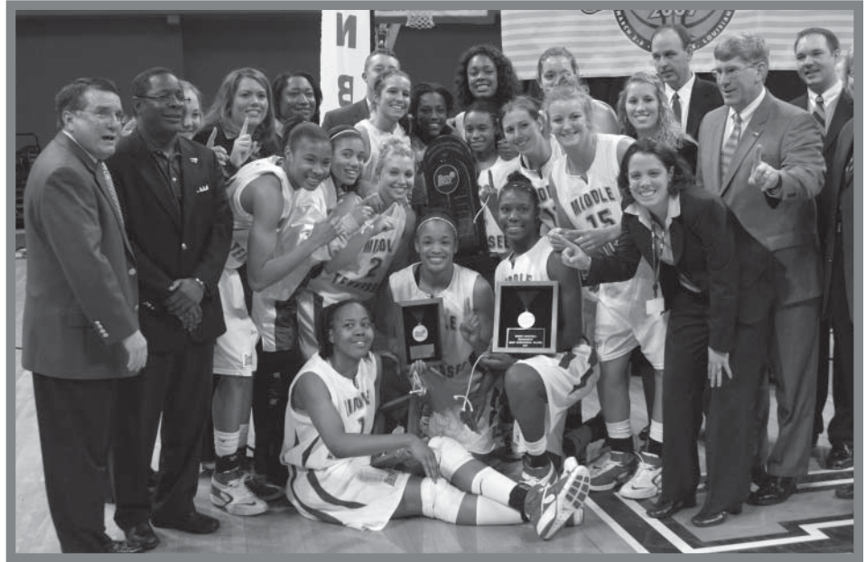
Middle Tennessee won its fourth straight Sun Belt Tournament in 2006-07, earning a fourth consecutive berth in the NCAA Tournament.

Under Insell's guidance, Shelbyville Central