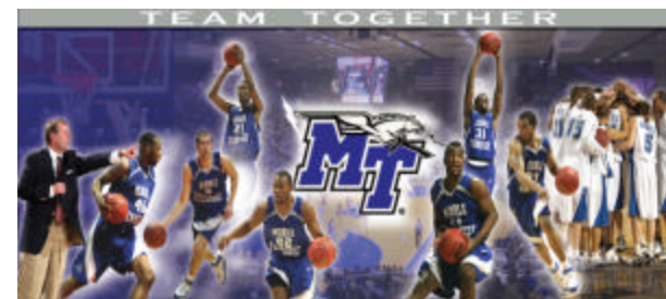
New Wall Signs in Practice Facility, Locker Room