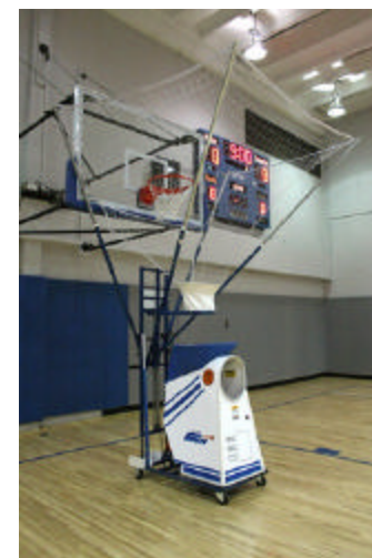
Wall Pads and "The Gun" Shoot-A-Way