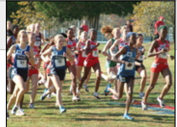
The Middle Tennessee Cross Country teams fared well in the SBC Championships in Bowling Green, Ky. The women finished second, while the men tied for third.