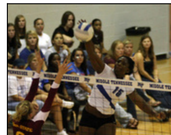
The Blue Raiders will begin the 2009 season by playing their first seven matches at home which includes two tournaments.

Middle Tennessee will play one match after the SBC Tournament as it normally does as a tune-up for the NCAA Tournament. The Blue Raiders will travel to St. Louis, Mo., to face Saint Louis on Saturday, Nov. 28.